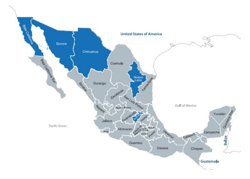
FIGURE 2 – MAIN AEROSPACE CLUSTERS IN MEXICO- BY STATE<sup>81</sup>

Mexico's most important aerospace cluster organisations include: