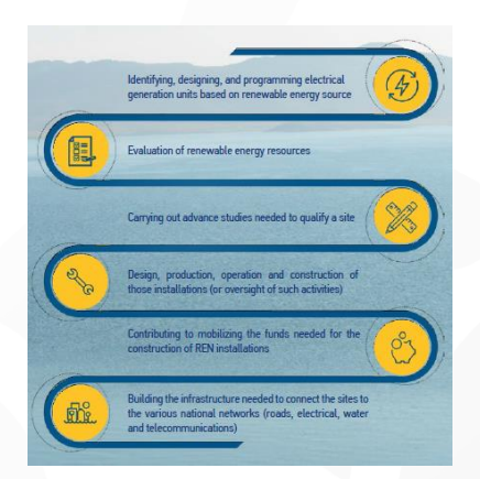
Figure 3: Scope of activities by MASEN<sup>26</sup>

The government established the Moroccan Agency for Solar Energy (Masen) in 2010, a public-private venture as the vehicle for managing the roll-out of the solar plan. It is a limited liability company which is 25 % each owned by the Government of Morocco, the state utility for water and electricity (ONEE), the Hassan II Fund for Economic and Social Development, and the Société d'Investissements Energétiques (SIE). Masen's aims are both to enhance energy capacities, and to support the development of a new industrial sector in Morocco through training, capacity building, and research and development (R&D).<sup>25</sup>