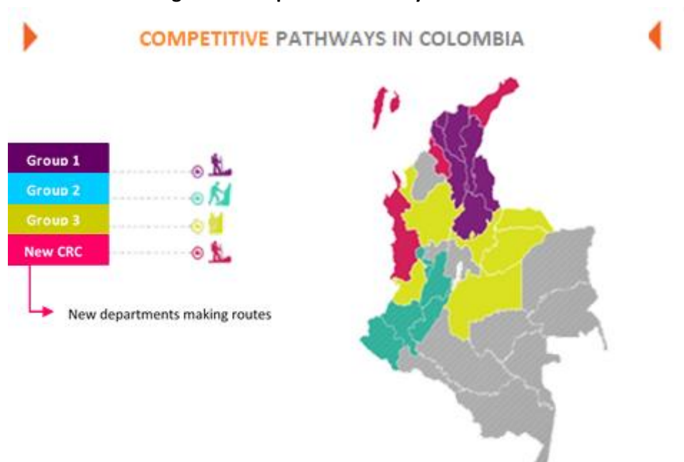
Figure 5. Competitive Pathways in Colombia 26

The 18 departments in the country in which the program was undertaken fall into three groups. Group 1 consists of the Departments of North Santander, Santander, Magdalena, Atlántico, Bolívar and Cesar. Group 2 of Huila, Tolima, Nariño, Cauca, Risaralda and Quindío. Group 3 of the Departments of Boyaca, Casanare, Meta, Arauca, Valle del Cauca and Antioquia. Finally, there are the other departments newly introducing pathways (new CRCs): Sucre, San Andrés, Chocó and Guajira. In accordance with the time lines set, the departments for the first two groups are close to finishing their two pathways, while those in group 3 are nearing completion of their first pathway and launching the second 27 .