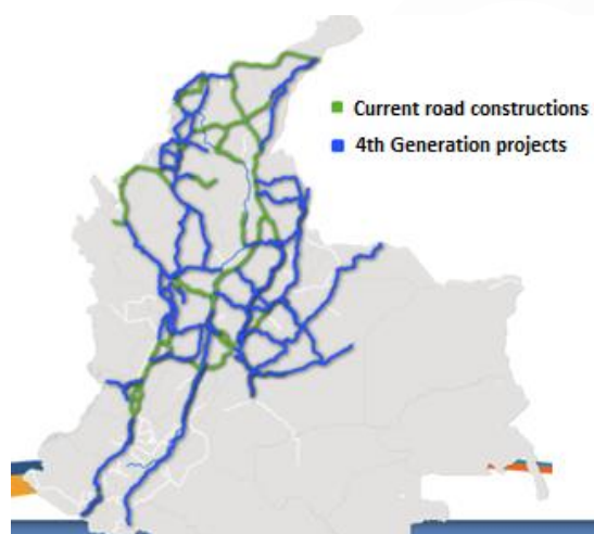
Figure 3. Colombian 4 th generation road projects 18 .

This project will have a significant impact on the growth of the Colombian economy, the competitiveness of the country and the generation of employment. Additionally, it will enable the logistics and transportation sector to grow as well, thereby bringing great benefits to already existing logistics and transport clusters 19 and will surely lead to the creation of new clusters in this sector all around the Colombian territory. Roads in poor condition generate about 30 percent of overcharges for the freight transport sector, the Government idea is to consolidate transport infrastructure to make transportation efficient and consequently make transport and logistics companies and clusters grow.