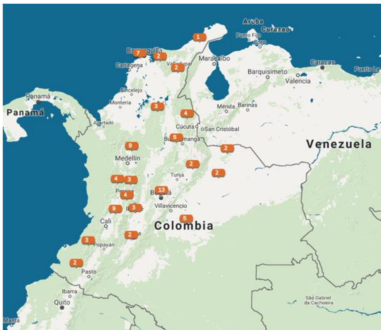
Figure 4. Cluster Mapping. Total number of cluster in Colombia: 87 24 .

The following map, created by the Red Cluster Colombia, shows the total number of cluster initiatives throughout the Colombian territory. The numbers in orange, refer to the number of existing clusters in that particular area or region. As you can see in the picture, most of the clusters are concentrated in the most populated regions of the country (from the center to the north), because the biggest and most important cities and economic centers of the country are located in these zones, mainly in the Andean and the Caribbean Region. It is worth highlighting that about 70 to 80 per cent of the Colombian population lives in urban areas, looking for better living conditions.