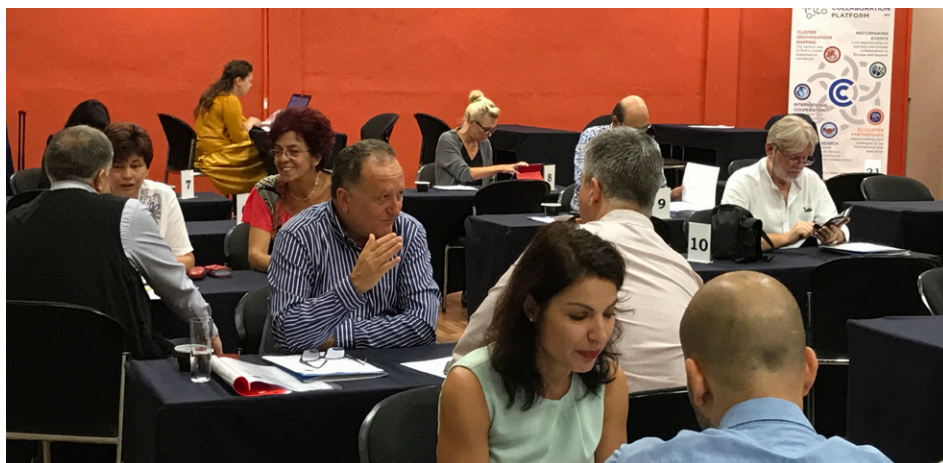
Participants at the numerous C2C meetings in Thessaloniki, Greece

More information about the event is available here .