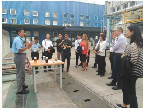
Figure 8. Site visit to Solar Applied Materials Technology

On the 6 th of June several activities were organised in parallel, which provided different options to the European delegation based on their interests. This included a Circular Economy site visit in Tainan, as well as a site visit to the Hsinchu Science Park. As part of the Circular Economy site visit in Tainan, the participant clusters gave short pitches about their organisations as part of a