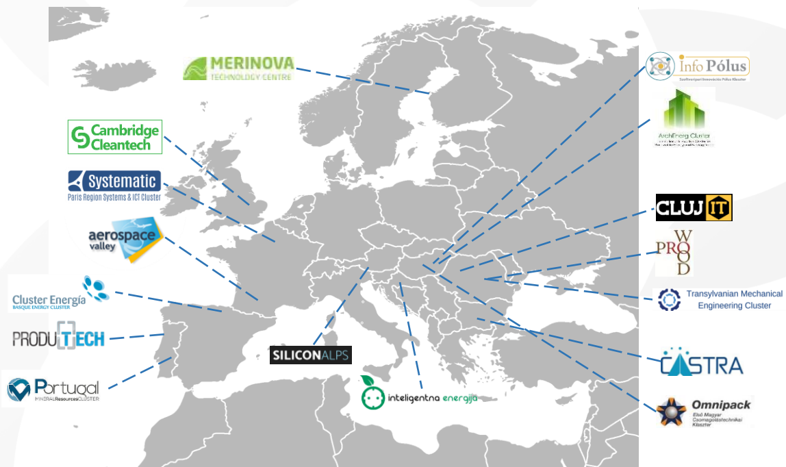
Figure 1. European Cluster Delegation

The European cluster delegation was comprised of 16 cluster organisations from 10 COSME countries, namely Austria, Bulgaria, Croatia, Finland, France, Hungary, Portugal, Romania, Spain and United Kingdom.