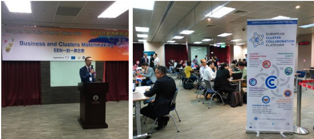
Figure 7. Matchmaking session

At the end of the 5 th of June, the cluster delegates had the opportunity to further interact with Taiwanese representatives through informal networking as part of the EIW Welcome Reception and COMPUTEX Welcome Networking event.