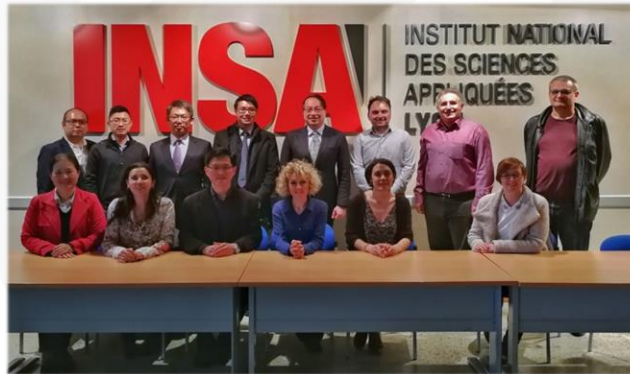
Figure 10. Group photo at INSA Lyon

Finally, on March 8 th there was a visit to the “Institut National des Sciences Appliquées” (INSA) Lyon , where the representatives of INSA Valor gave an institutional presentation about the university and its activities as well as their different spin-offs and organisations.