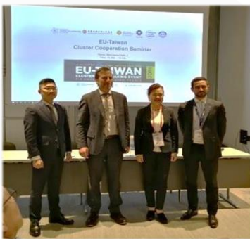
Figure 2. Opening remarks speakers