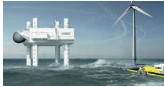
DarNEC (Danish Wave Energy Center) DENMARK