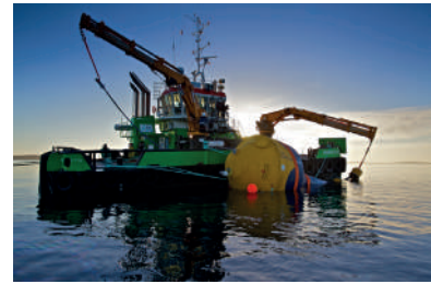
CorPower Ocean AB SWEDEN