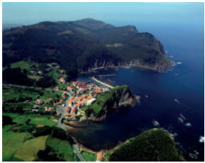
BIMEP (Biscay Marine Energy Platform) SPAIN