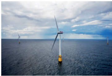
Statoil - Hywind pilot park SCOTLAND