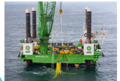
DEME Blue Energy BELGIUM